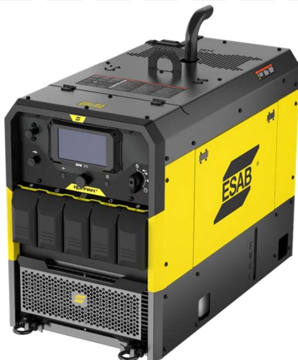
Ruffian EMP 270G EDW